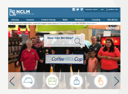
Nearly 500,000 website visits

The League's communications arm, expanded in staff size and role, became the Strategic Communications and Member Engagement (SCME) in 2022, and focused on member communications, marketing, events planning, education and more.